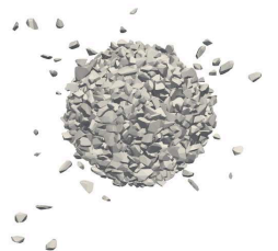
Figure 1: Accretion of 3375 self-gravitating polyhedral particles by means of the CD Method.